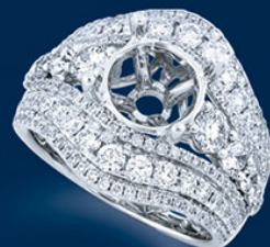
* Semi Mount Ring