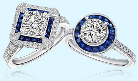
Love Splendor Diamond and Sapphire Ring by EJI®