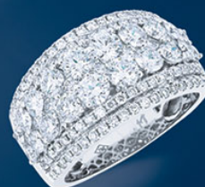
* Diamond Jewellery