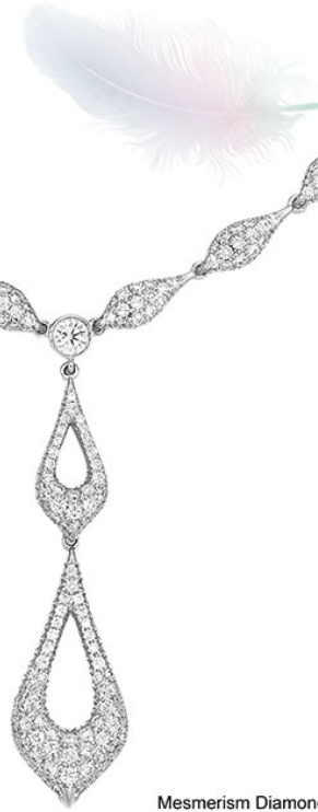
Mesmerism Diamond Necklace by EJI®

Aiming to be distinguished from the typical, the series is redefined by using the simple design with modern handcraft from carefully selected material to precise control under each phase of productions.