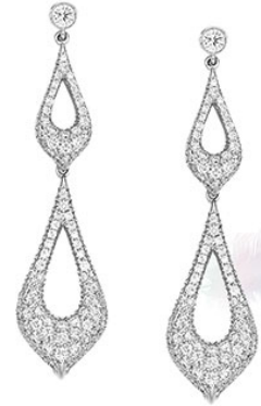
Mesmerism Diamond Earrings by EJI®