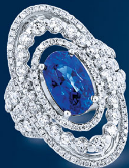
* Color Stone