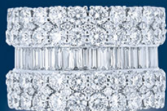
* Round and Baguette